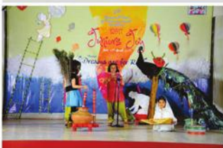
Students Quality Circles: An Initiative of Modernage to Develop Quality Mindset